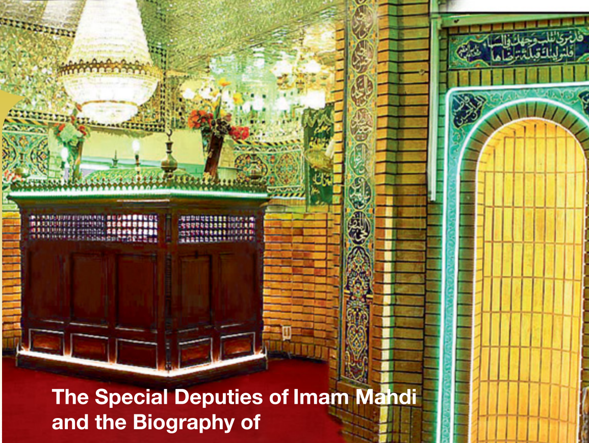
The Special Deputies of Imam Mahdi and the Biography of