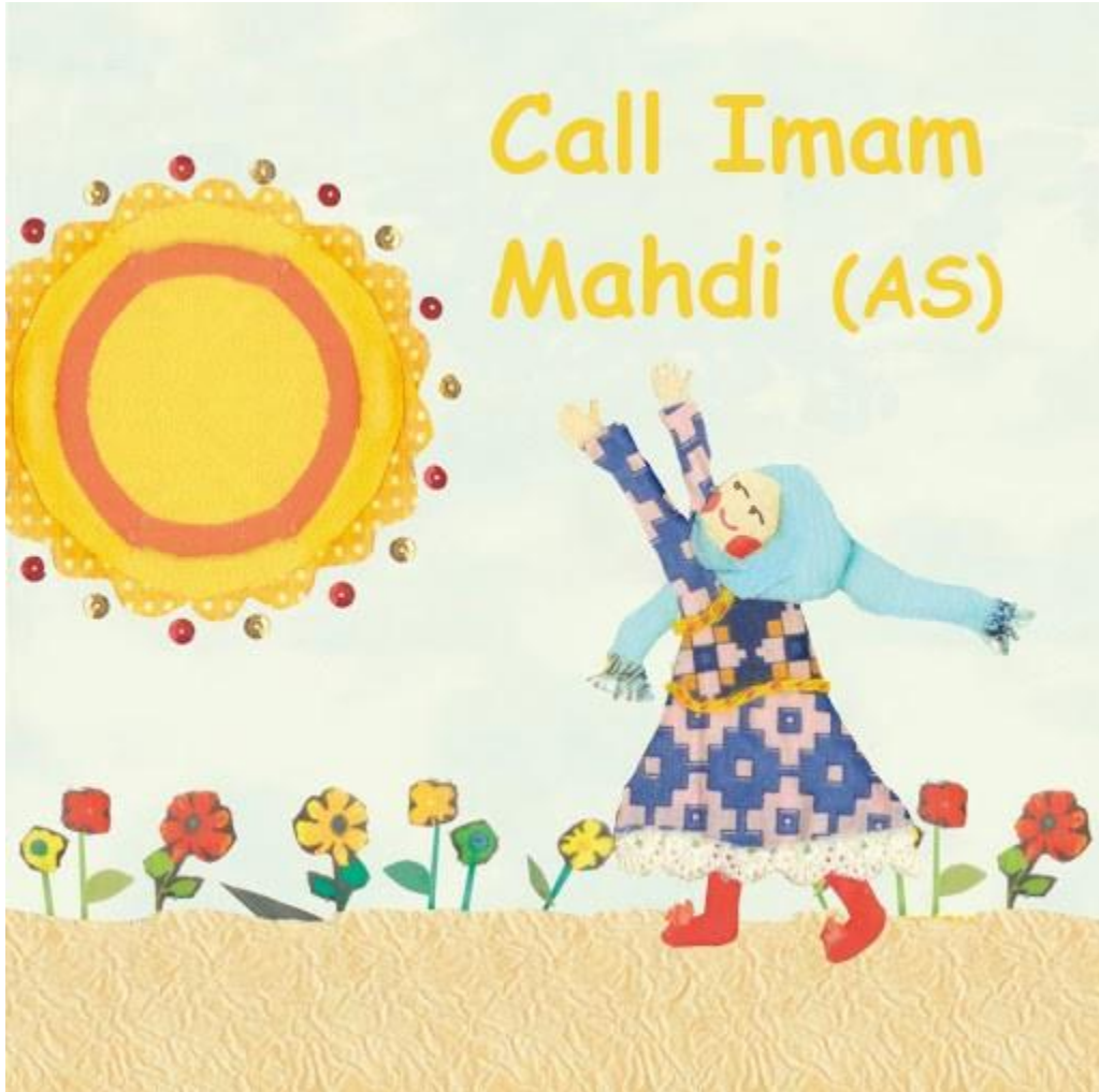
Call Imam Mahdi (for kids under 12 years old)